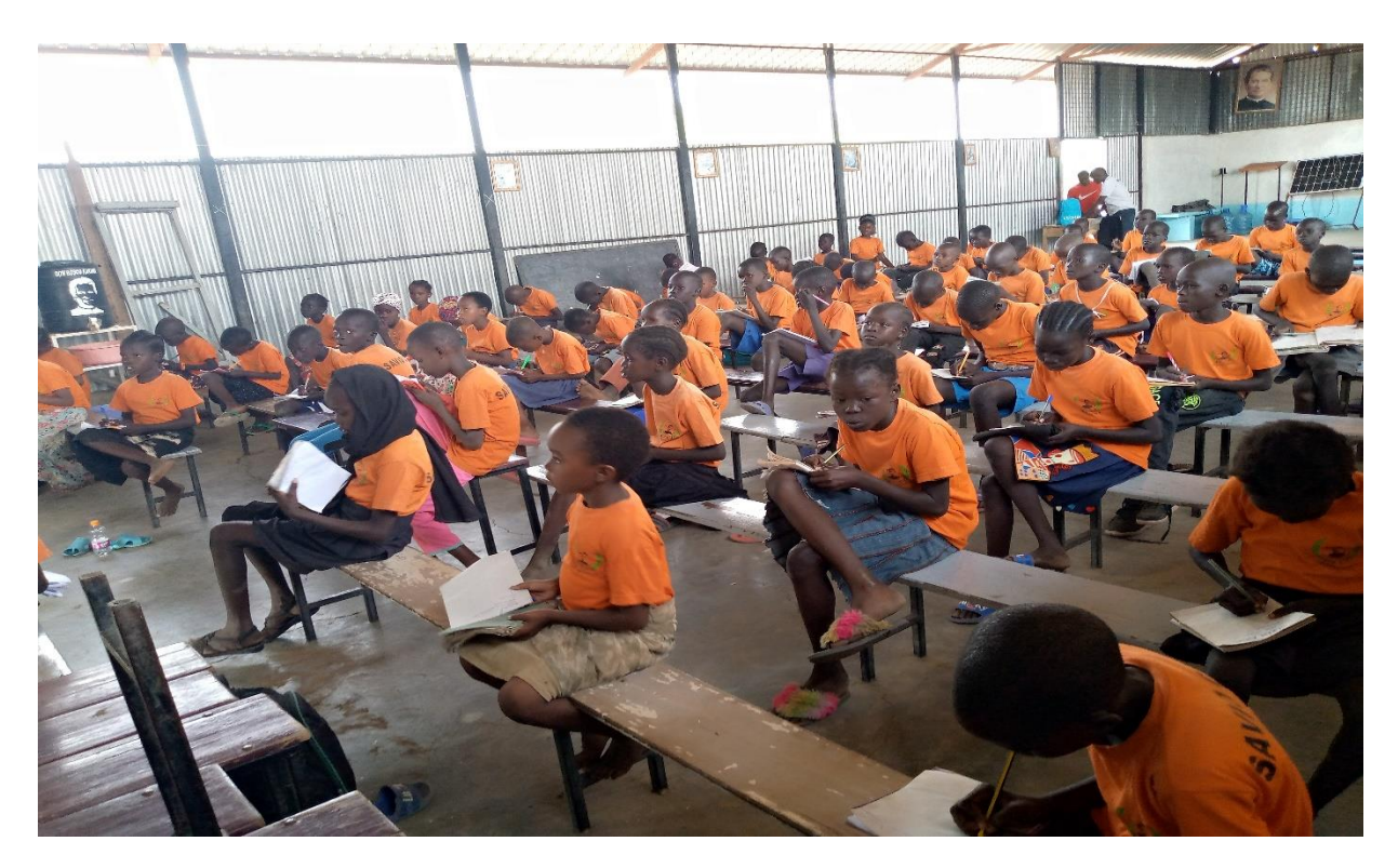
Mary Help of Christians

Below are some images of children doing exams in some centers